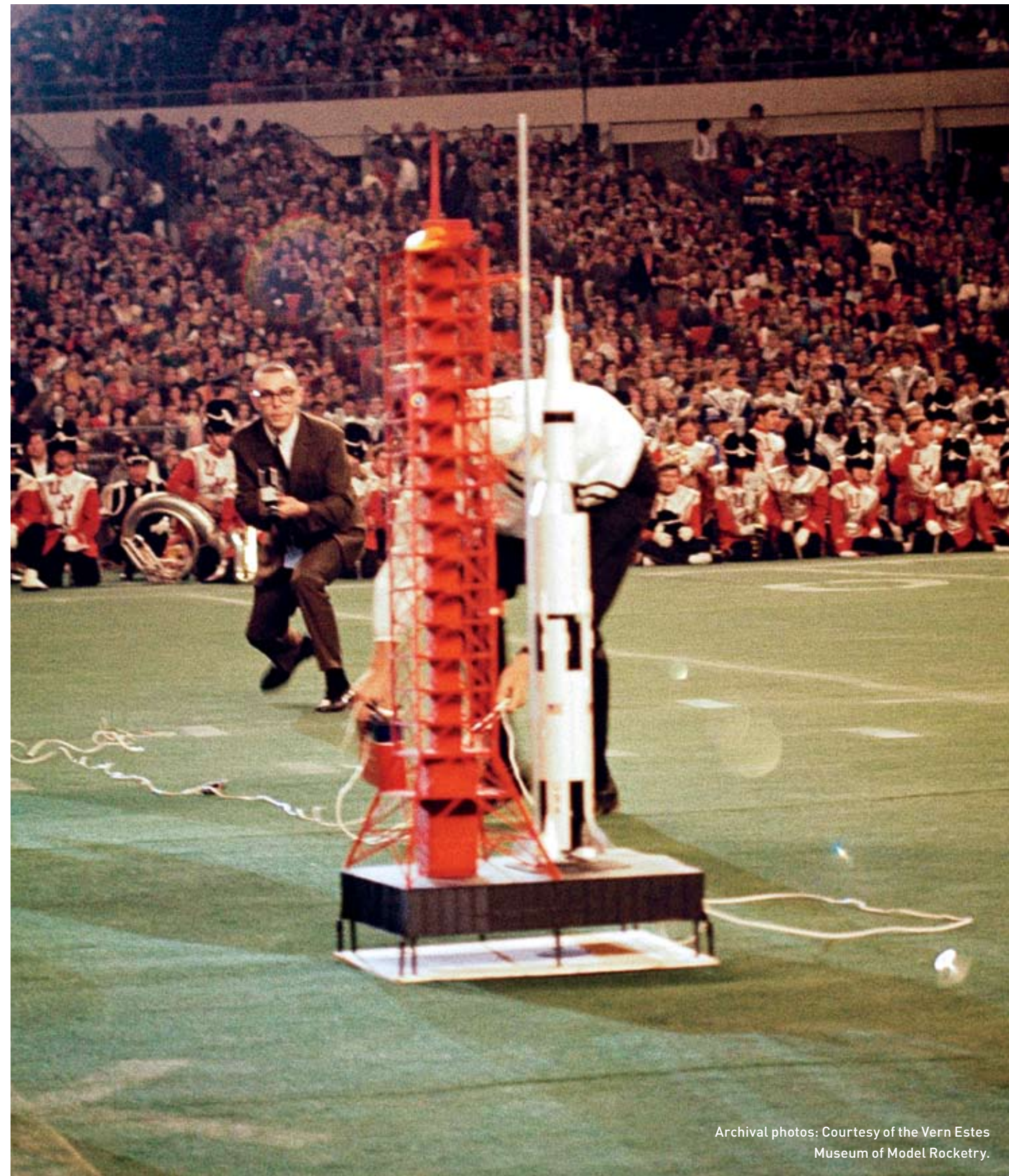
Archival photos: Courtesy of the Vern Estes Museum of Model Rocketry.